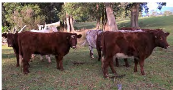
2 year old Registered Females