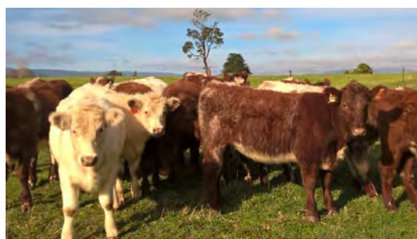
Yearling Registered Females