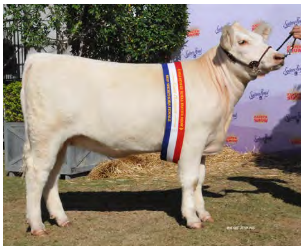
Grand Champion Beef Shorthorn Female Morningtime Kiribati's Blossom 2