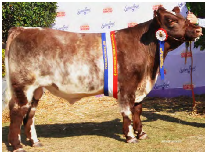
Grand Champion and Best Exhibit Morningtime Nara